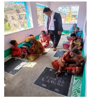
DG IN THE ADULT LITERACY CENTRE AT JAMURIA NAMOPARA F P SCHOOL DURING HIS PROJECT VISIT