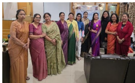
DG WITH LADY ROTARIANS & ANNES DURING HIS CLUB OFFICIAL VISIT