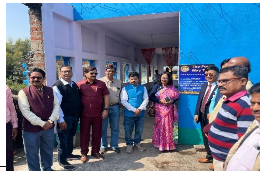
DISPLAY OF ROTARY'S 4-WAY TEST BOARD AT JAMURIA NAMOPARA F P SCHOOL DURING DISTRICT GOVERNOR'S OFFICIAL PROJECT VISIT