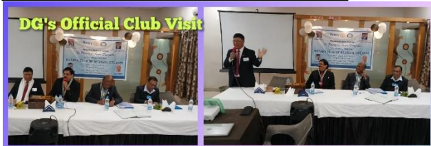
DG's Official Club Visit