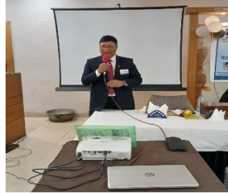
DG & AG SPEAKS